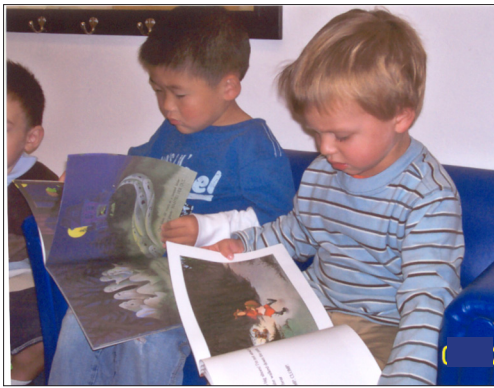
Moraga- Children spend time with their chosen book as a group activity.

"Adding Drama and props to books and storytelling really engages children and makes the story memorable. Encouraging children to participate in telling a story, or act it out."