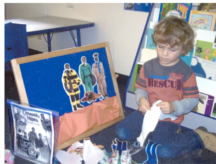
Pleasanton- a child creates a story using a flannel board.

Our language rich environments encourage children to connect pictures with the written word. Children also begin to understand the magic of books when we put them in places where they may use them for reference, such as books for building in the block area, or a children's cook book in the kitchen area.